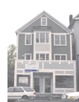
Real Estate Development